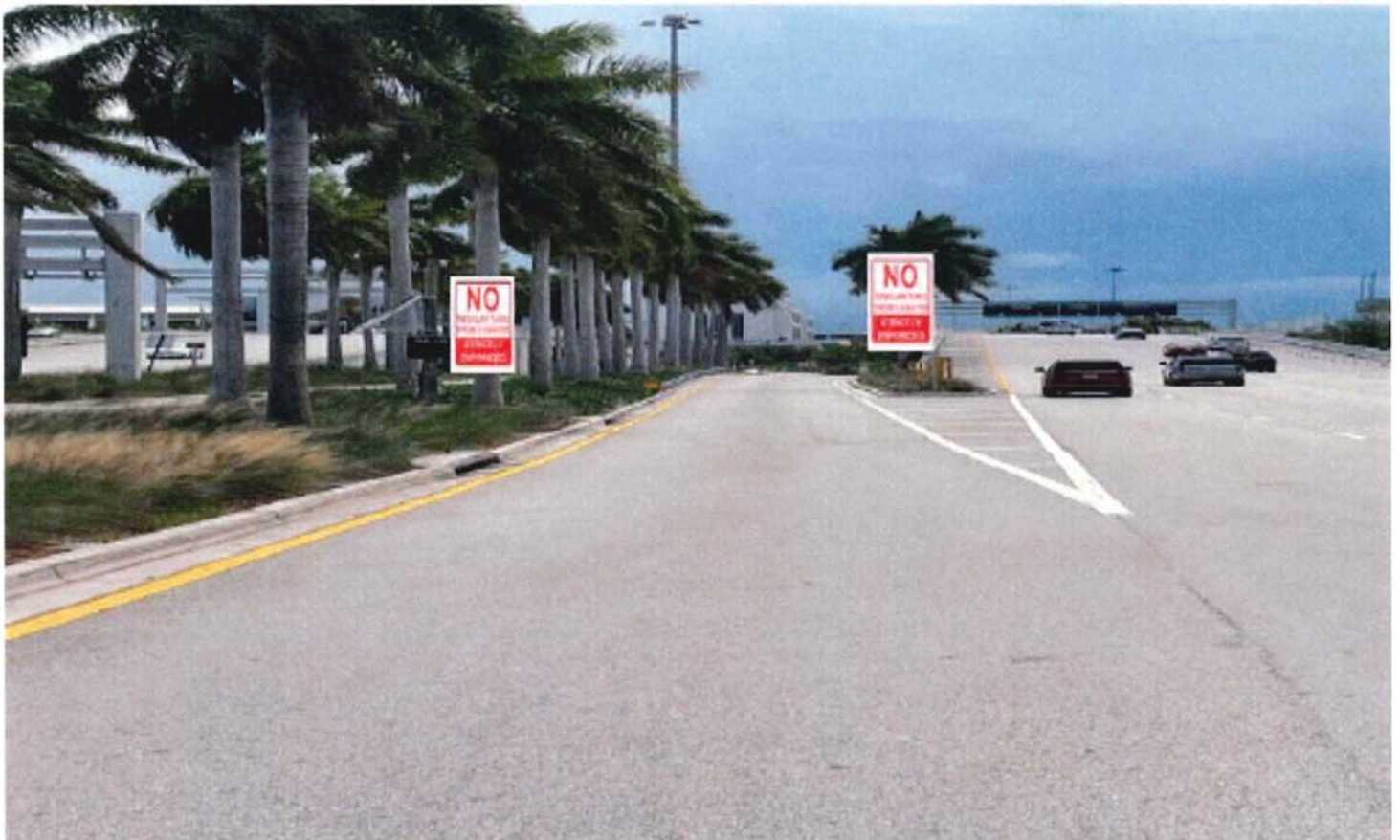
Annex 2 – Central Boulevard (NW 21 st Street) Westbound exit to West Service Road – Miami International Airport